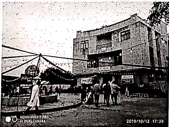
Figure 1 andiya Night, 12/10/2019