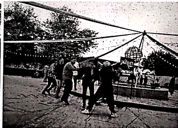
Figure 2 Dandiya Night, 12/10/2019